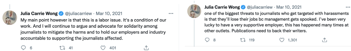
Figure 5: Twitter thread from March 2021. 21