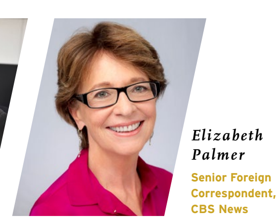
Excellence in International Reporting Award