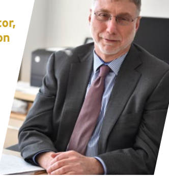
ICFJ Founders Award for Excellence in Journalism